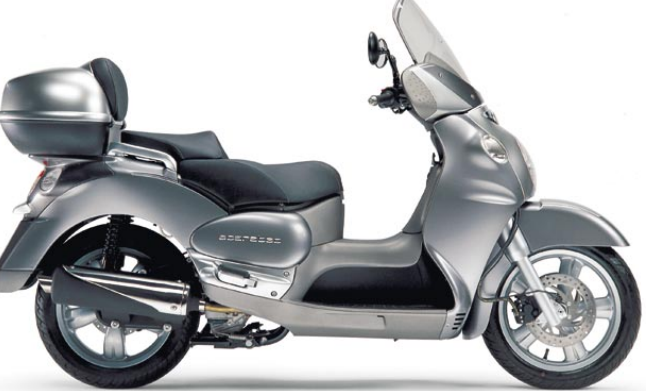
beige mou/platinum grey

Scarabeo 500 is equipped with an engine that guarantees power and top speed that place the bike in the forefront of its class, together with exceptional flexibility, even at low speeds, with the enormous advantage of the automatic transmission that eliminates the stress associated with constant gear changes. The electronic fuel injection and catalytic exhaust system ensure low fuel consumption and full compliance with the stringent Euro 2 environmental standards.